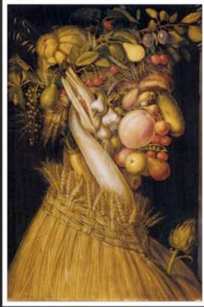
Giuseppe Arcimboldo, "Summer"

Portraits made of food and still life style