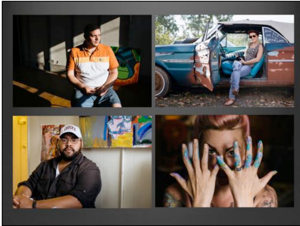
Did a project called Artists In Jackson – 15 jackson-born artists