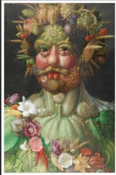
Giuseppe Arcimboldo, "Vertumnus"

This theme of food and seasons...betcha I could do that with still life photography.